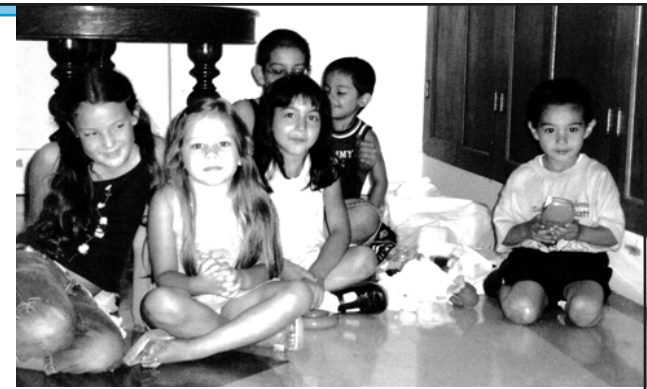
Pictured above: children who received clothing from the Children's Clothes Closet at Bethlehem Lutheran Church, Portland

The doors opened in August of 2006. They gave away not only children's clothing but also baby items and